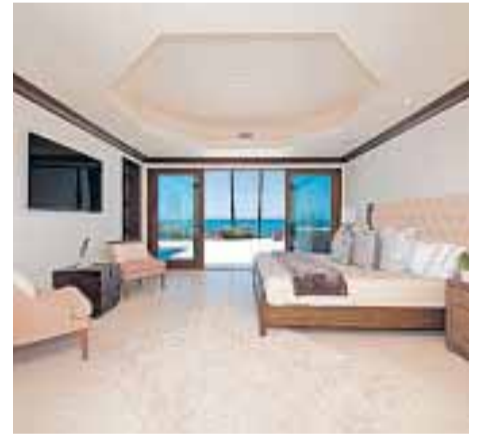
This incredible property is one of La Jolla’s most iconic homes, with 140 feet of ocean frontage!